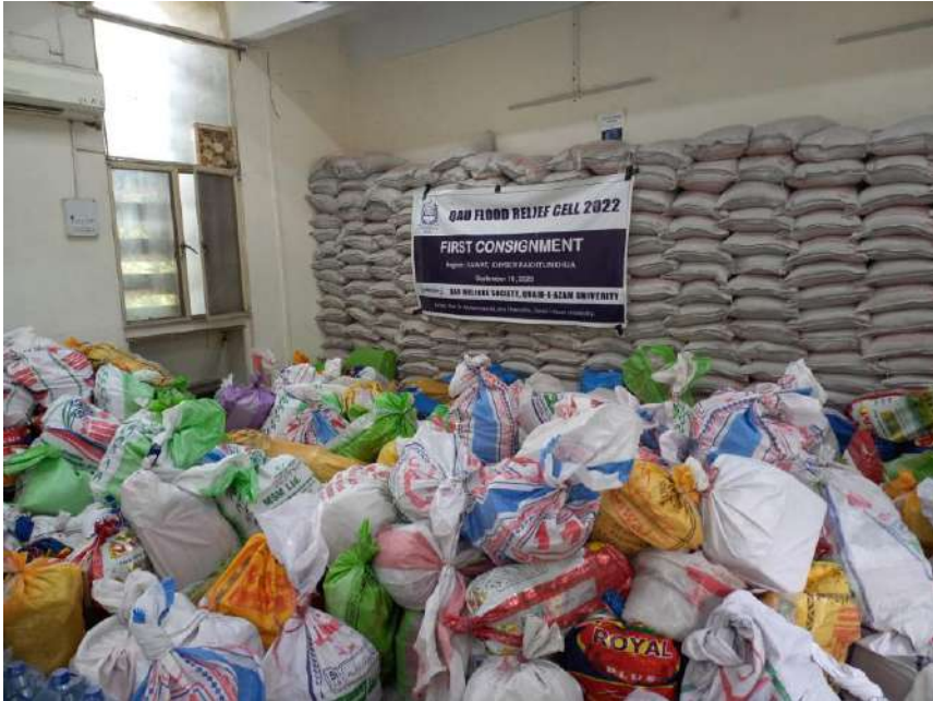
Behrain, Matta, Sawat (September 10, 2022)