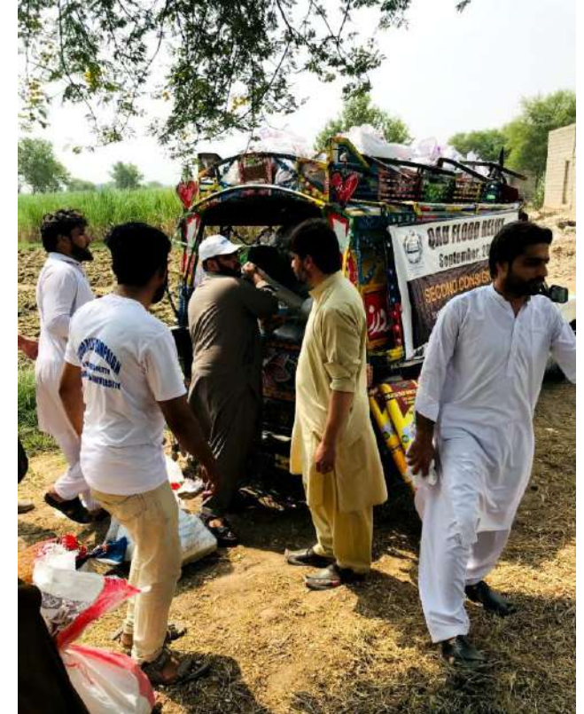
Paharpur, Dera Ismail Khan (September 16, 2022)

Ration Bags : 282 (worth: 0.795 million PKR)