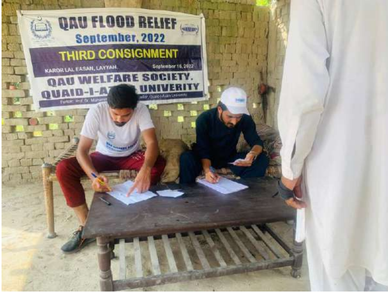
Layyah (September 16, 2022)