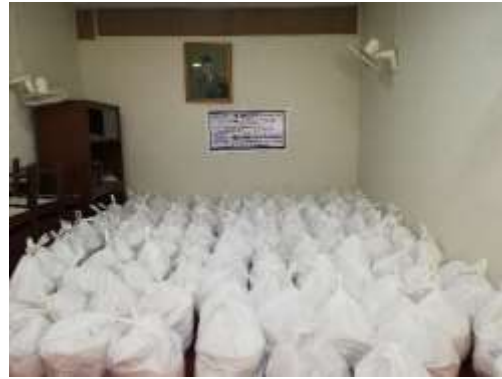
Table 3.3 Second Regular Consignment of Ration Bags for the Support of Low-Income Families