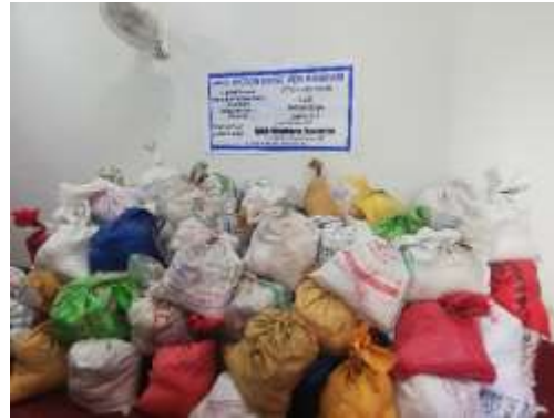
Table 3.4 Third Consignment of Ration Bags for the Support of Low-Income Families