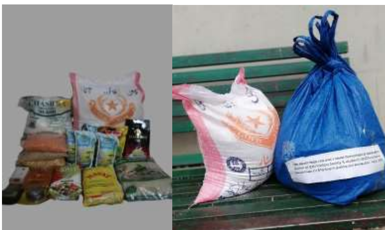
Table 2.1 First Consignment of 145 Ration Bags for the Daily Wage Employees of QAU

In first round 145 ration bags were distributed among the daily wage employees of QAU. This round took place in two phases; 100 bags were distributed on April 7, 2020 and another 45 bags to the remaining were distributed on April 20, 2020. The summary of expenditures is given below: