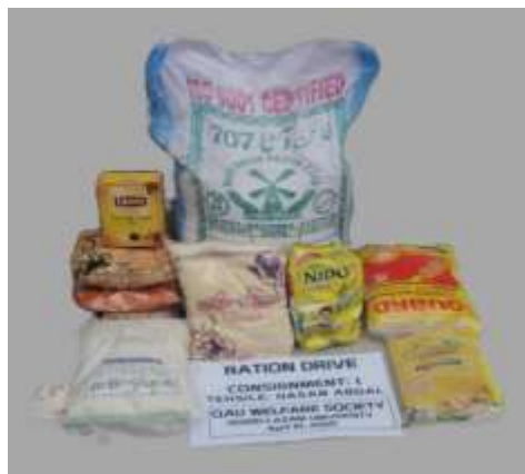
Table 3.2 First Regular Consignment of Ration Bags for the Support of Low-Income Families