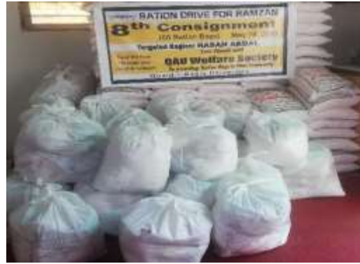
Table 3.9 Eighth Consignment of Ration Bags for the Support of Low-Income Families