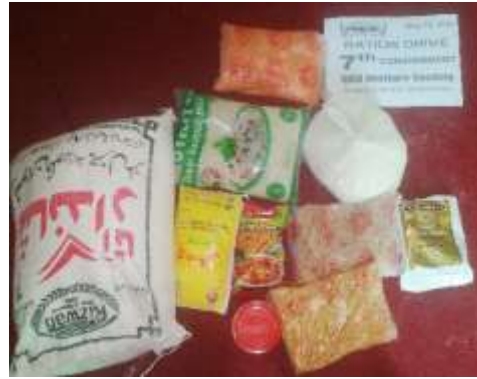
Table 3.8 Seventh Consignment of Ration Bags for the Support of Low-Income Families