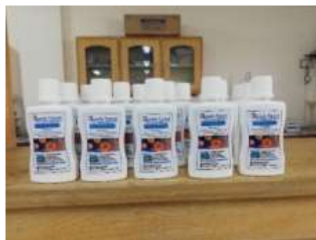
Table 1.1 Preventive Kits for the Lower Staff of QAU