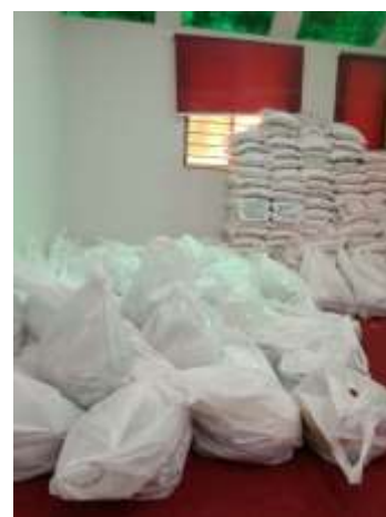
Table 2.3 Third Consignment of 100 Ration Bags for the Daily Wage Employees of QAU

The third consignment of 100 ration bags was distributed on May 18, 2020. Each bag comprises of 10 kg wheat, 2 kg Basmati Rice, 2 kg Sugar, 3 kg pulses, 200 grams Black Tea, 200 grams mix masala, 500 grams pickle, 500 grams dates, 750 ml milk and 2 dish washers. Summary of expenditures incurred on this consignment is given in Table 2.3.