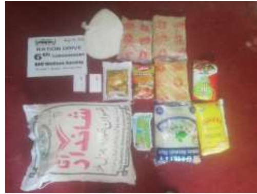
Table 3.7 Sixth Consignment of Ration Bags for the Support of Low-Income Families