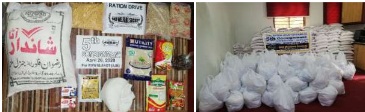
Table 3.6 Fifth Consignment of Ration Bags for the Support of Low-Income Families